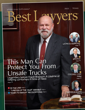
2023 Best Lawyers magazine cover